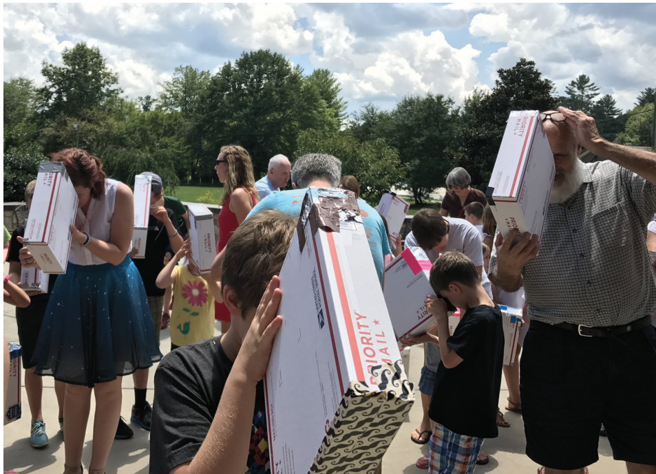
Figure 2. Transylvania County Library, Brevard, North Carolina

“[I did] a training exercise with the librarians at the Manhattan Library in Kansas. I went over several ideas of how we can present to their public about the eclipse. . . I gave them handouts and posters for their display. . . I brought many props [and activities] about moon phases, eclipses, the Sun, and [even] the Pocket Solar System activity. . . They loved everything I showed them. . . We even discussed extending our partnership for future outreach programs with their public.”—Amateur Astronomer (Member of one of the Night Sky Network Clubs)