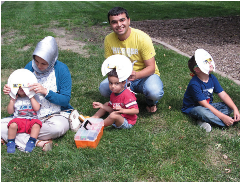
Figure 3. Keene Memorial Library, Fremont, Nebraska

A survey of Eclipse Kit recipients, performed using Survey Monkey, drew 1,193 responses, giving us statistically significant data. About 85% of the librarians indicated that they got all their eclipse glasses through our project. Others were able to get donations or internal funding to acquire an additional supply. More than 65% of the libraries indicated that they had made special efforts to get glasses and information to audiences normally underserved by and underrepresented in science.